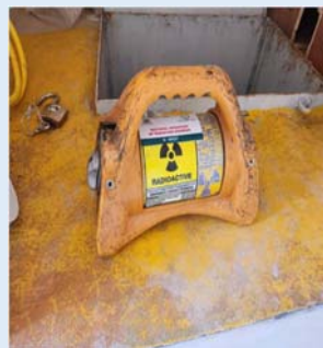
An Iridium-192 source in non destructive testing for oil pipelines