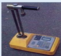
A moisture density gauge used in road construction

2. Man-made sources such as X-ray machines, cancer treatment equipment, and industrial devices.