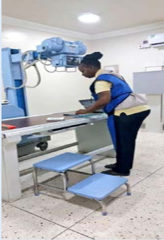
An AEC inspector conducting and inspection on a mobile X-ray machine