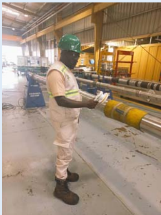
An AEC inspector conducting and inspection on one of the oil well logging tools