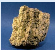
A uranium ore containing radioactive material

Natural sources such as cosmic radiation from space, rocks and soil.