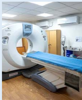
A CT Scanner for diagnosis

Uganda uses ionizing radiation in several sectors: