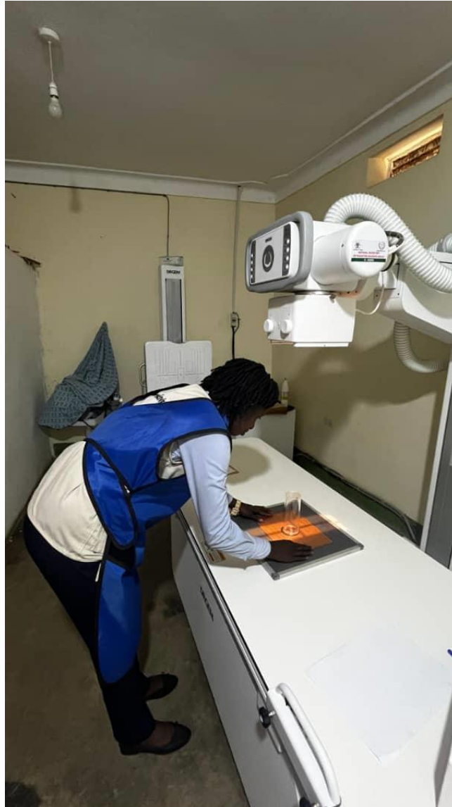
Figure 2: AEC inspector setting up equipment for the collimation and beam alignment test at one of the medical facilities