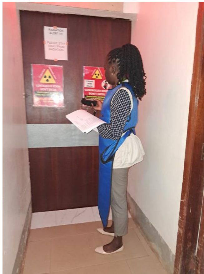
Figure 1: AEC inspector taking radiation survey measurements behind the patient entrance door to the imaging room housing an X-ray machine.