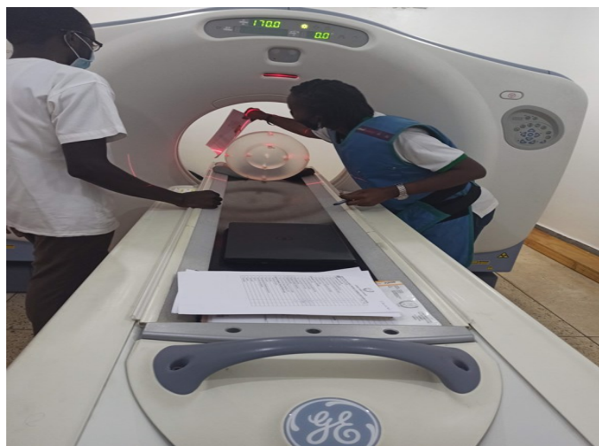
Fig 2: Pre-authorization Inspection of a Computed Tomography (CT) Machine