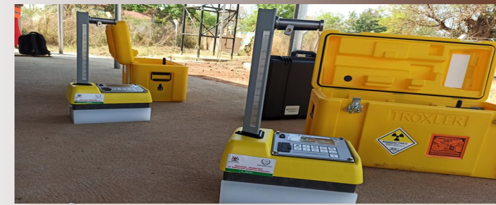
Fig 1: Nuclear gauges inventorized with AEC Sticker

After Review and Assessment of Applications, pre-authorization inspections are conducted to verify the information provided as well as assess the performance of the machine and other safety (and security) related requirements in place.